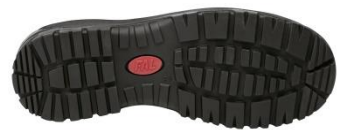
Antistatic + Fuel oil and heat resistant sole