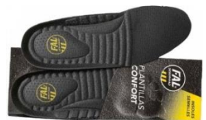
Removable Insole. Washable