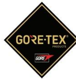
Waterproof + breathable lining membrane