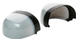
Non metallic Toe Cap