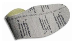
Flexible protective insole