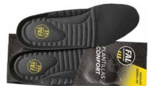
Removable Insole. Washable