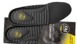
Removable Insole. Washable